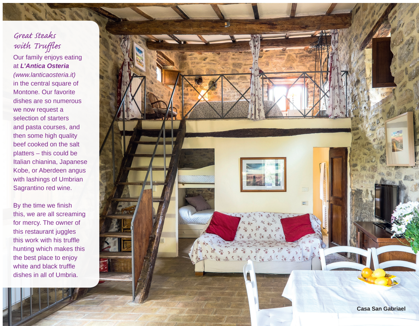
Casa San Gabriel

By the time we finish this, we are all screaming for mercy. The owner of this restaurant juggles this work with his truffle hunting which makes this the best place to enjoy white and black truffle dishes in all of Umbria.